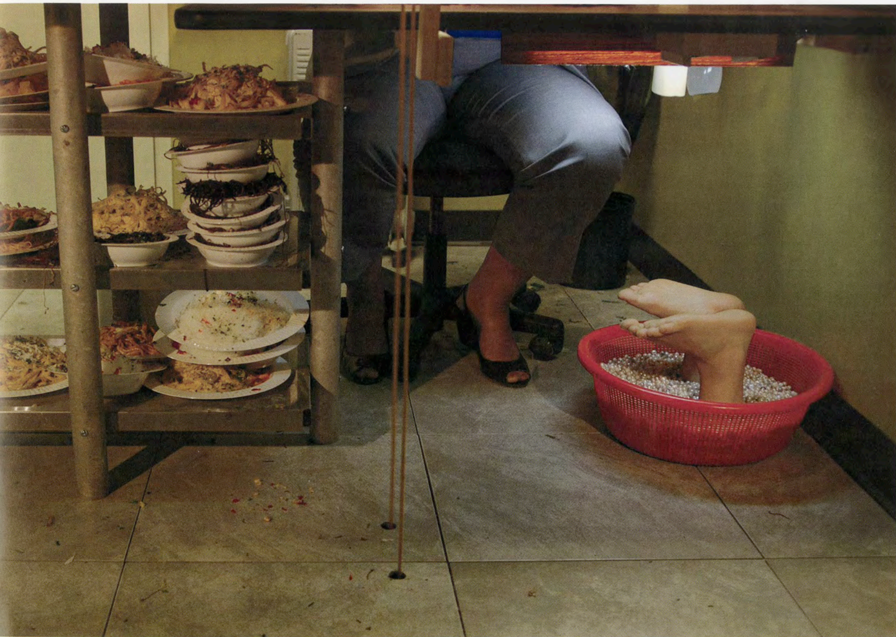
Stills from NoNoseKnows , 2015.