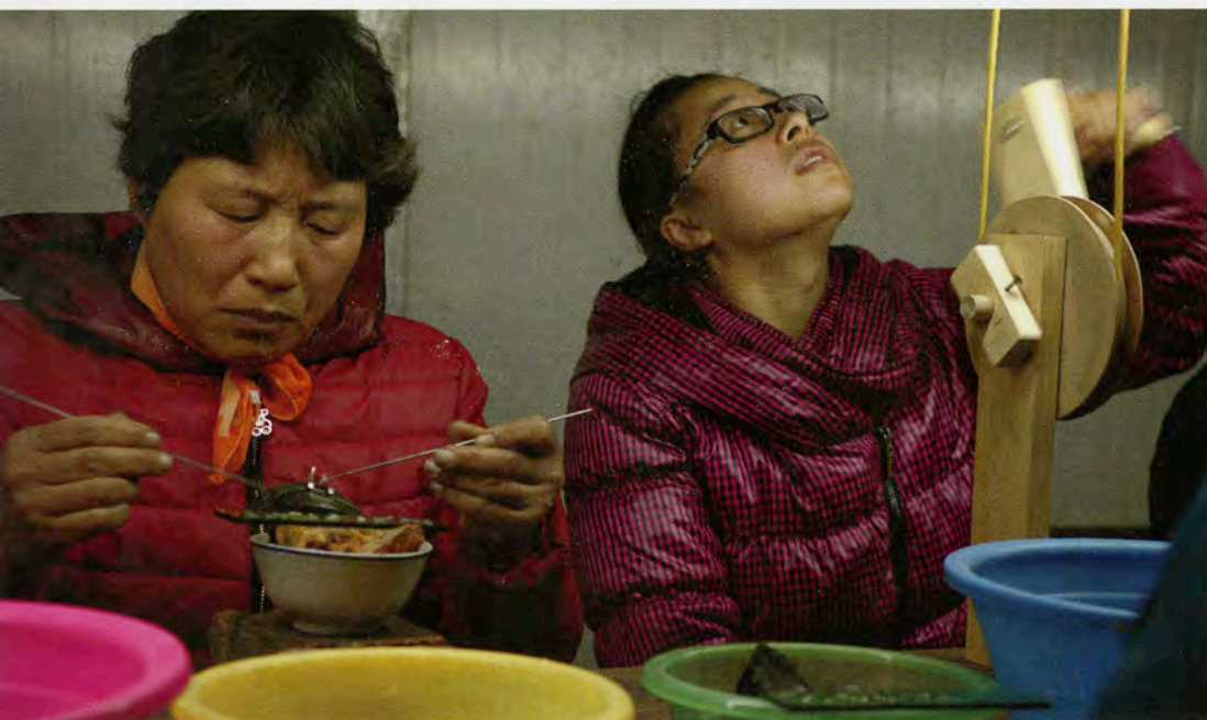
Stills from a rough cut of NoNoseKnows , 2015.